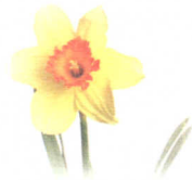
Daffodil, Paper White Narcissus spp.