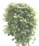
Swedish Ivy, Creeping Charlie Plectranthus australis