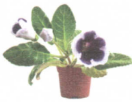
Gloxinia Sinningia speciosa