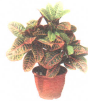
Croton Codiaeum variegatum