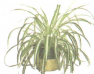
Spider Plant, Ribbon Plant Chlorophytum comosum