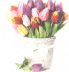
Tulip and Tulip Bulb Tulipa spp.