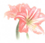
Amaryllis, Belladonna Lily Amaryllis hippastrum