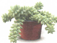
Burrow's Tail Sedum morganianum