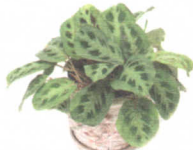
Maranta, Prayer Plant Maranta leuconeura