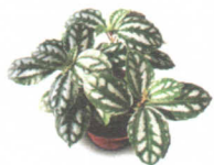
Aluminum Plant Pilea cadieri