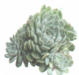
Hens and Chickens Echeveria elegans