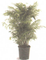
Parlour Palm Chamaedorea elegans