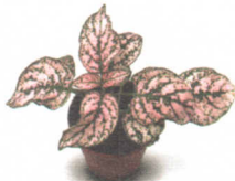
Baby's Tears, Polka Dot Plant, Pink Splash Hypoestes phyllostachya