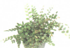
Cliff Brake, Button Fern Pellaea rotundifolia