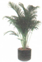
Golden Cane Palm Dypsis lutescens