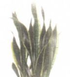
Snake Plant, Mother-In-Law's Tongue Sansevieria trifasciata

Plants from the NON PET FRIENDLY list should be placed in an inaccessible area to protect your pets.