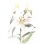
Easter Lily Lilium longiflorum