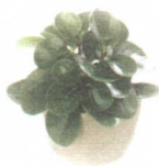
American Rubber Plant Peperomia obtusifolia