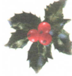
English Holly Ilex aquifolium