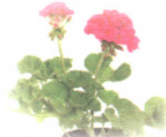
Geranium Pelargonium spp.