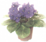
African Violet Saintpaulia spp.