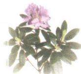
Azalea Rhododendron spp.