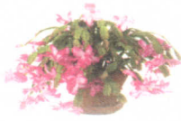
Christmas Cactus Schlumbergera bridgesii