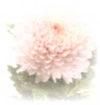
Chrysanthemum, Daisy, Mum Chrysanthemum spp.