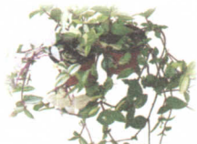
Tahitian Bridal Veil Tradescantia multicolor