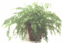
Boston Fern Nephrolepis exaltata bostoniensis