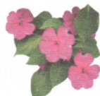
Impatiens Plant, Busy Lizzy Impatiens spp.