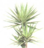
Yucca Yucca spp.