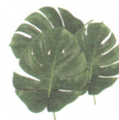
Cutleaf Philodendron, Hurricane Plant Monstera deliciosa