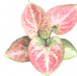
Caladium, Elephant Ears Caladium spp.