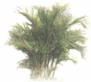
Feather Palm Nephrolepis exaltata