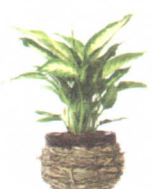
Dieffenbachia, Giant Dumb Cane Dieffenbachia spp.