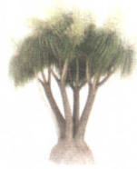
Pony Tail Plant, Elephant-Foot Tree Beaucarnea recurvata