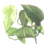
Horsehead, Heartleaf Philodendron Philodendron spp.