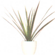
Dracaena, Corn Plant, Ribbon Plant Dracaena spp.