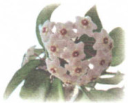
Porcelain Flower, Waxplant Hoya carnosa