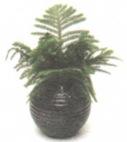
Norfolk Pine, House Pine Araucaria heterophylla