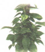
Golden Pothos, Devil's Ivy Epipremnum aureum