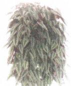
Climbing Begonia, Rex Begonia Cissis discolor