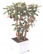
Jade Plant, Dwarf Rubber Plant Crassula argentea